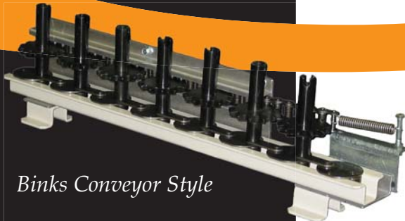
Binks Conveyor Style