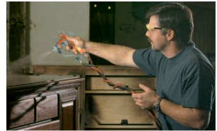
A superior finish with reduced overspray and VOC emissions.

Manufactured under an ISO 9001 Quality System .