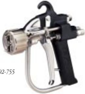
Poly-Craft HVLG Gun 202-755