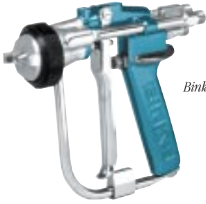
Binks Century HVLG Gun 102-2500