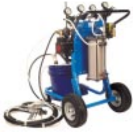
Poly-Craft Grani-Tec System 205-1000