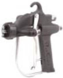
Poly-Craft 202-1055 Grani-Gun