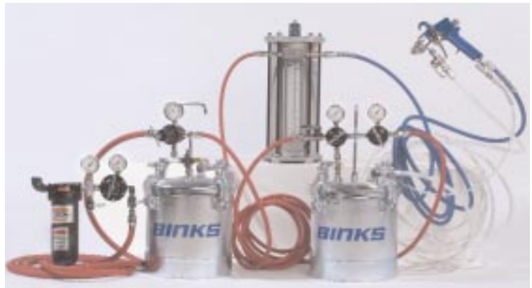
Binks Grani Coat 2-Gallon Tank System 105-1084 (.110 orifice)